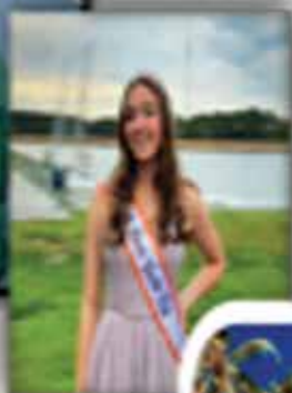
Meeting New People